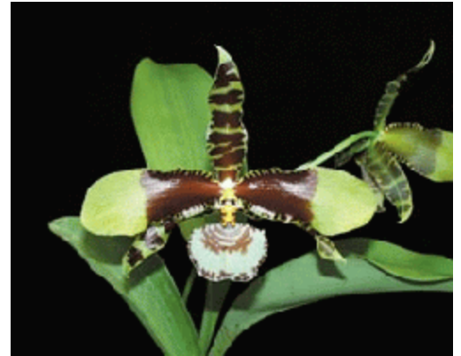
Odontoglossum "Rawdon Jester"

Potting should be done as new growth becomes about half-mature, which is usually in the spring or autumn. These plants need to be underpotted, so when repotting leave only enough room for one or two years of new growth. Underpotting also enables the grower to provide the more frequent watering these plants need as the smaller pots dry more quickly and evenly when filled with roots. A fine-grade potting medium with excellent drainage is required; because the medium is kept moist, annual or biannual repotting is normal. Spread the roots over a cone of potting medium and fill in around the roots with more medium. Firm the potting mix around the roots. Keep humidity high and the pot dry until new roots form.