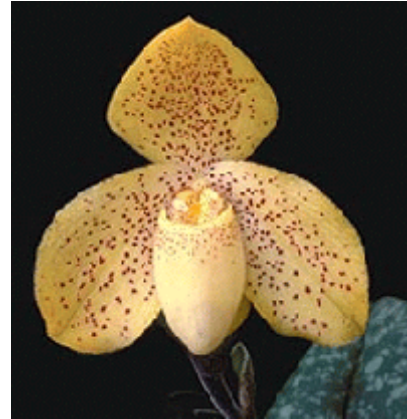
Paphiopedilum concolor var. Hennisianum